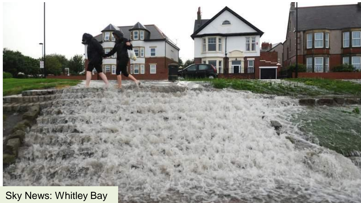
Sky News: Whitley Bay

101% of the average rainfall for the whole of June fell in those two hours.